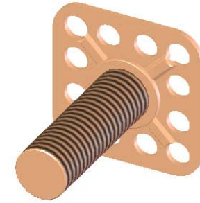
BASEPLATE SHOWN APPROX SIZE [ 1:1 SCALE ]