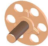
BASEPLATE SHOWN APPROX SIZE [ 1:1 SCALE ]