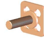
BASEPLATE SHOWN APPROX SIZE [ 1:1 SCALE ]