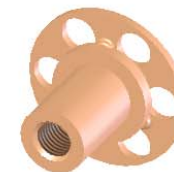
BASEPLATE SHOWN APPROX SIZE [ 1:1 SCALE ]