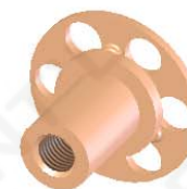
BASEPLATE SHOWN APPROX SIZE [ 1:1 SCALE ]