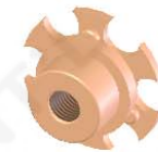
BASEPLATE SHOWN APPROX SIZE [ 1:1 SCALE ]