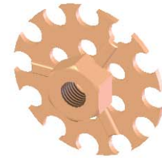
BASEPLATE SHOWN APPROX SIZE [ 1:1 SCALE ]