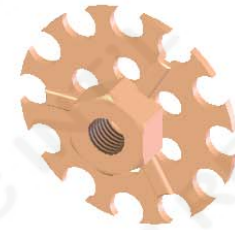
BASEPLATE SHOWN APPROX SIZE [ 1:1 SCALE ]