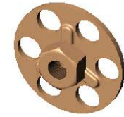
BASEPLATE SHOWN APPROX SIZE [ 1:1 SCALE ]