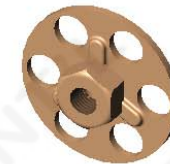
BASEPLATE SHOWN APPROX SIZE [ 1:1 SCALE ]